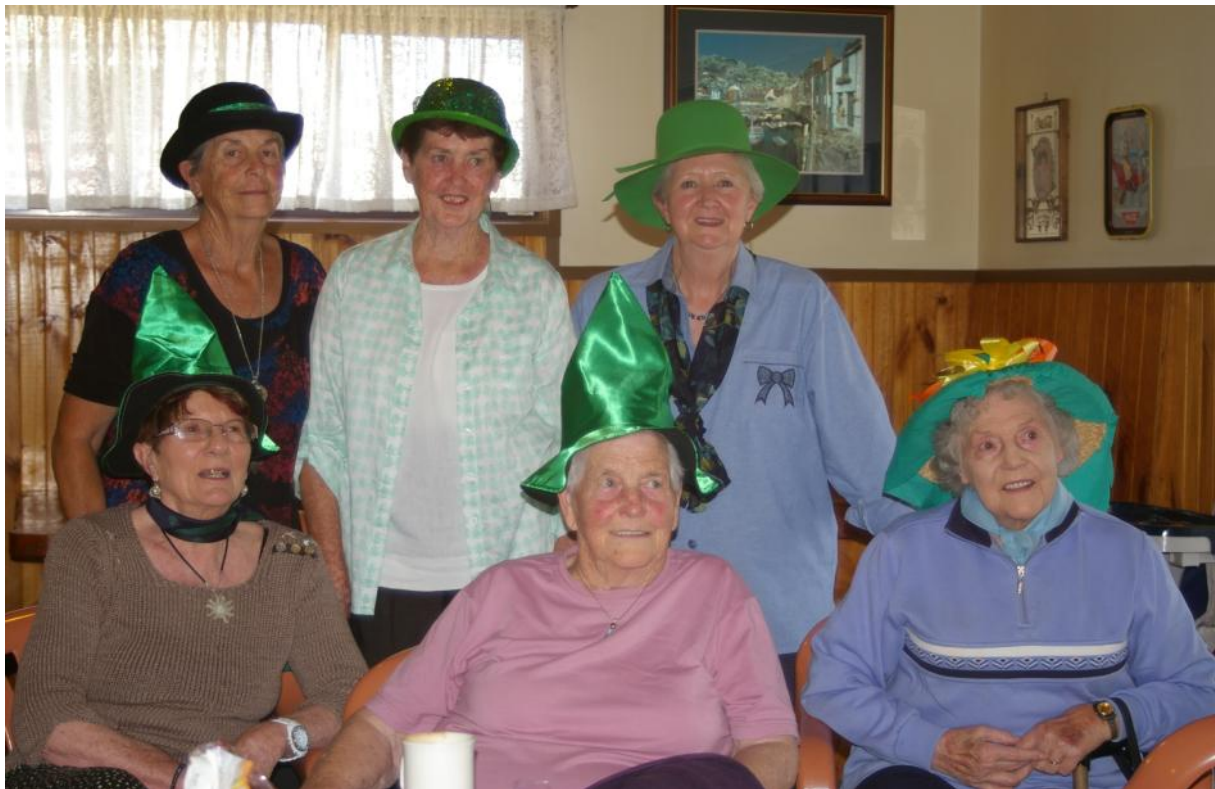
Above: The ladies got into the spirit of things wearing their green hats.