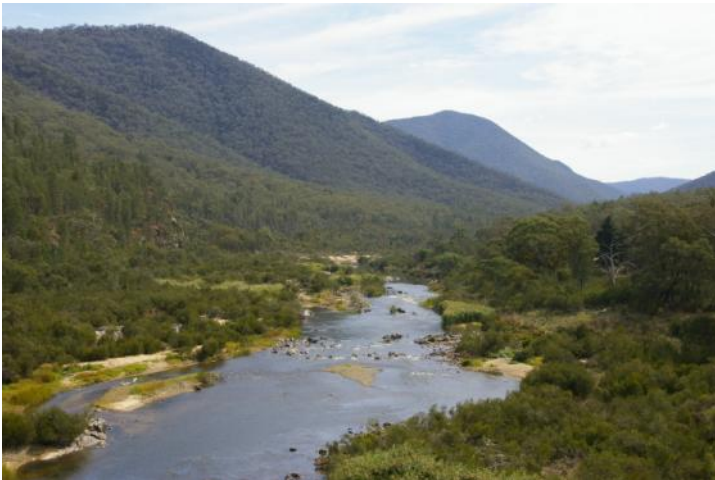
Above: Bringing the cattle down, L: The Snowy River and crossing the Snowy. Below right: The hills are "twice as steep and twice as rough"