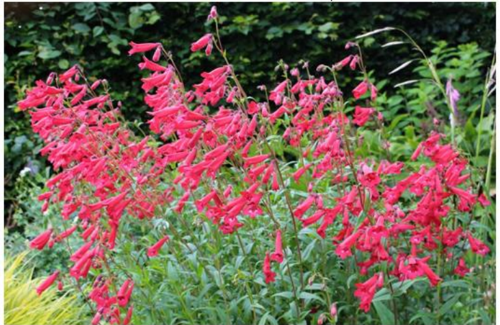
Figure 1 This cultivar pentstemon 'Windsor Red' is commonly seen in district gardens. The name pentstemon for this group of plants means five ( pent ) stamens and the vast majority of the species come from the prairies of North America.

Petunias can be revitalised with a haircut now. They are such giving plants tolerating heat as well as temperatures to minus 4 degrees so there is plenty of growing time left for them. The other fail safe annual is the pansy which gives reliable winter cheer and it should be established fairly soon to bulk up before winter.