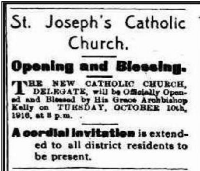
"Delegate Argus" - October 1916

Following on from last year's successful celebrations marking the centenary of the laying of the foundation stone for the present church building, preparations are well in hand for "A Century of Celebrating Mass" commemoration on Saturday 15 & Sunday 16 October 2016. This will mark 100 years since the first Mass was held in the present church in October 1916.