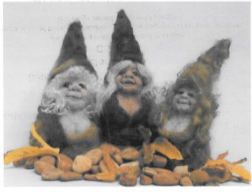
Create a Gnome take it home