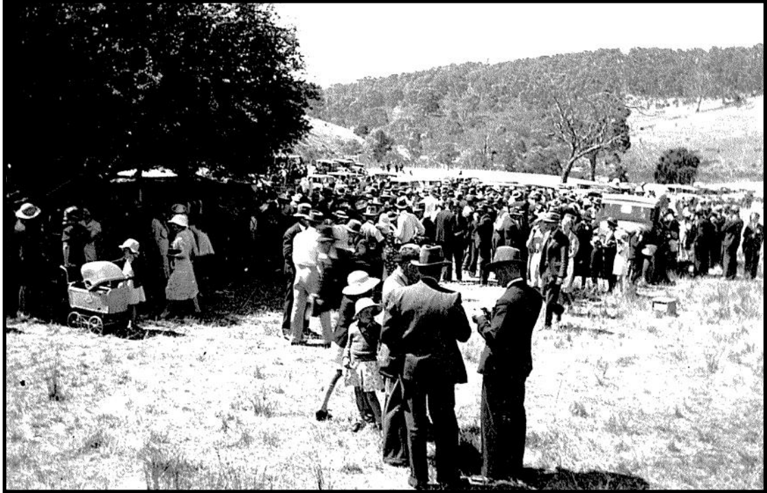
The Annual Races at Cabanandra.