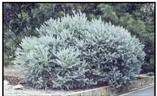
The wattle Acacia covenyi blooms prolifically in winter