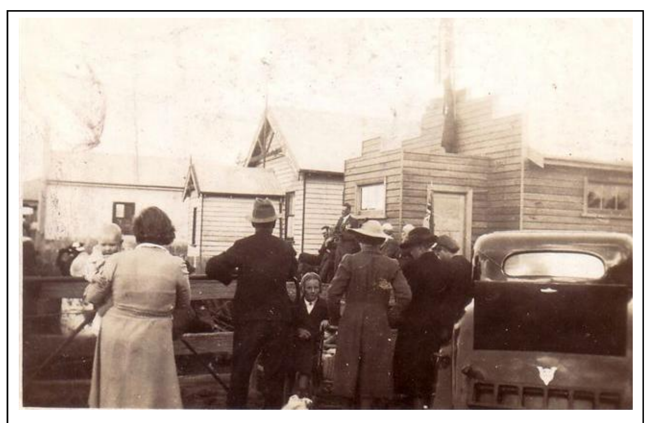
The above photo shows the opening of the RSL Hall in 1940.