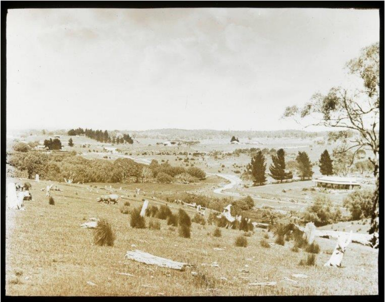
A very old photo of Delegate, not many houses to be seen.