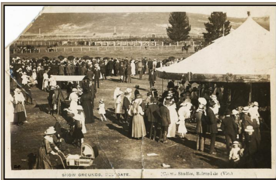
Judging by the ladies dress, this was also taken a long time ago when the showground was on land which is now Bill Jeffreys Park