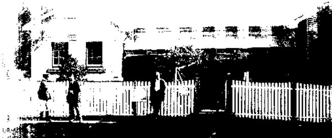
Delegate Police Station

We have a great lot of old photos in our collection and would welcome more for us to copy and add to our collection. Below is an early photo of Delegate Police Station and a very early photo of Delegate.