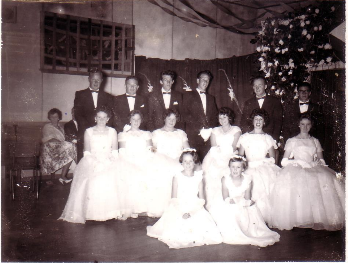
An old photo of a Deb Ball possibly circa 1960's.