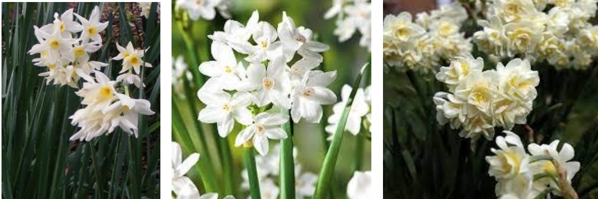
left to right Common, Paperwhite and the double flowered Earlicheer

Daffodil and jonquil bulbs, along with snowflakes, are making their colourful contribution to the garden now. These stalwarts of the bulb tribe can be safely left in the ground to emerge year after year. But if you grow different cultivars it is best to keep the clumps separate because stronger varieties out-compete their neighbours and eventually takeover. Common jonquils will eliminate more delicate types such as 'paperwhite' and 'earlicheer' mostly due to shading as the common has voluminous foliage. Interestingly they all have distinctly different perfumes.