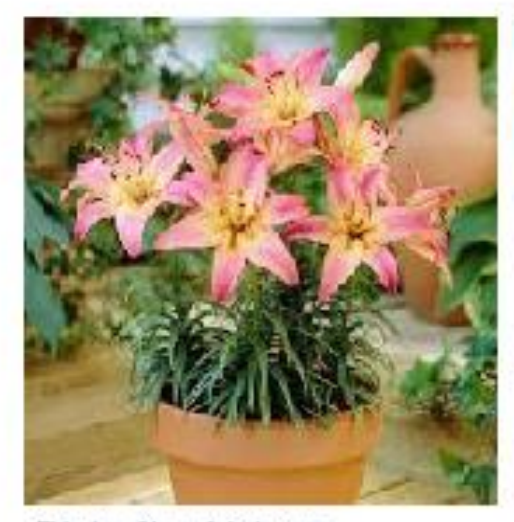
. This dwarf is an Asiatic type.

Every now and then one suddenly discovers something about gardening that is so obvious that one can't quite believe that it has previously escaped notice. For me, this summer, it has been the revelation that hybrid liliums are easy to grow as well as robust in our climate and that the glossy foliage, and even the flowers, have withstood the recent super-hot days. I have previously relegated liliums to the 'too hard basket' assuming that 'hot house' and 'specialised' cultivation was required simply because their most common role is as a favourite florist's flower.