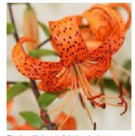
The tiger lily is one of the hundred or so species. It is one that is relatively easy to grow.

storage parts which may be either in the form of rhizomes or fleshy bulbs. In common with other bulbous plants, the flower quality and performance depends entirely on the growing conditions in the previous year. The scaley lilium bulbs have no protective coating so dry out easily and must always be protected before planting. Division usually occurs by bulblets that form underground but bulbils may also form on the stems. Specialised multiplication can be achieved by manipulating the scales that peel off the bulbs but this is tricky and slow. Breeders must obtain new varieties from seed produced in planned crosses which is also a slow method of obtaining flowering size plants.