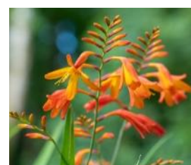
Left to Right: Scadoxus, Fairy Rods ( Diorama ) Pineapple lily ( Eucomis ), Arum lily ( Zantedeschia ), Peacock lily ( Morea ) Lachenalia, Sparaxis, Crocosmia.

A Note. 'Bulb' is a term used loosely to describe plants that have adopted some form food storage mechanism and these may be corms (swollen vertical stems), rhizomes (swollen horizontal stems), or true bulbs (layered leaf bases) that supports either evergreen or seasonal growth. For example, knowing that a plant survives as a rhizome gives a whole new understanding to its care needs and potential to flourish. A rhizome is a modified stem lying horizontally in the soil. Now think of a stem of a shrub. It will have a bud at the tip that continues to grow upward and there will be growing points all along that stem wherever there is a leaf node. Now imagine laying that stem on the soil. It is easy to see that roots will form on the underside and the bud at each leaf axil will grow upward. You can now predict that the stem will not want to be too deep in the soil or the buds will struggle to emerge, that the bud at the tip will continue to move forward and that if this horizontal stem is cut between nodes that an independent plant will be produced. You know this as a consequence of making the effort to differentiate between a bulb and a rhizome. You are now a savvy gardener who automatically knows how to best handle a bearded iris or efficiently deal with couch grass. Congratulations!