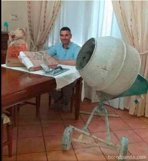
Working from home

If you need 144 rolls of toilet paper for a 14 day quarantine you probably should've been seeing a Doctor long before COVID-19