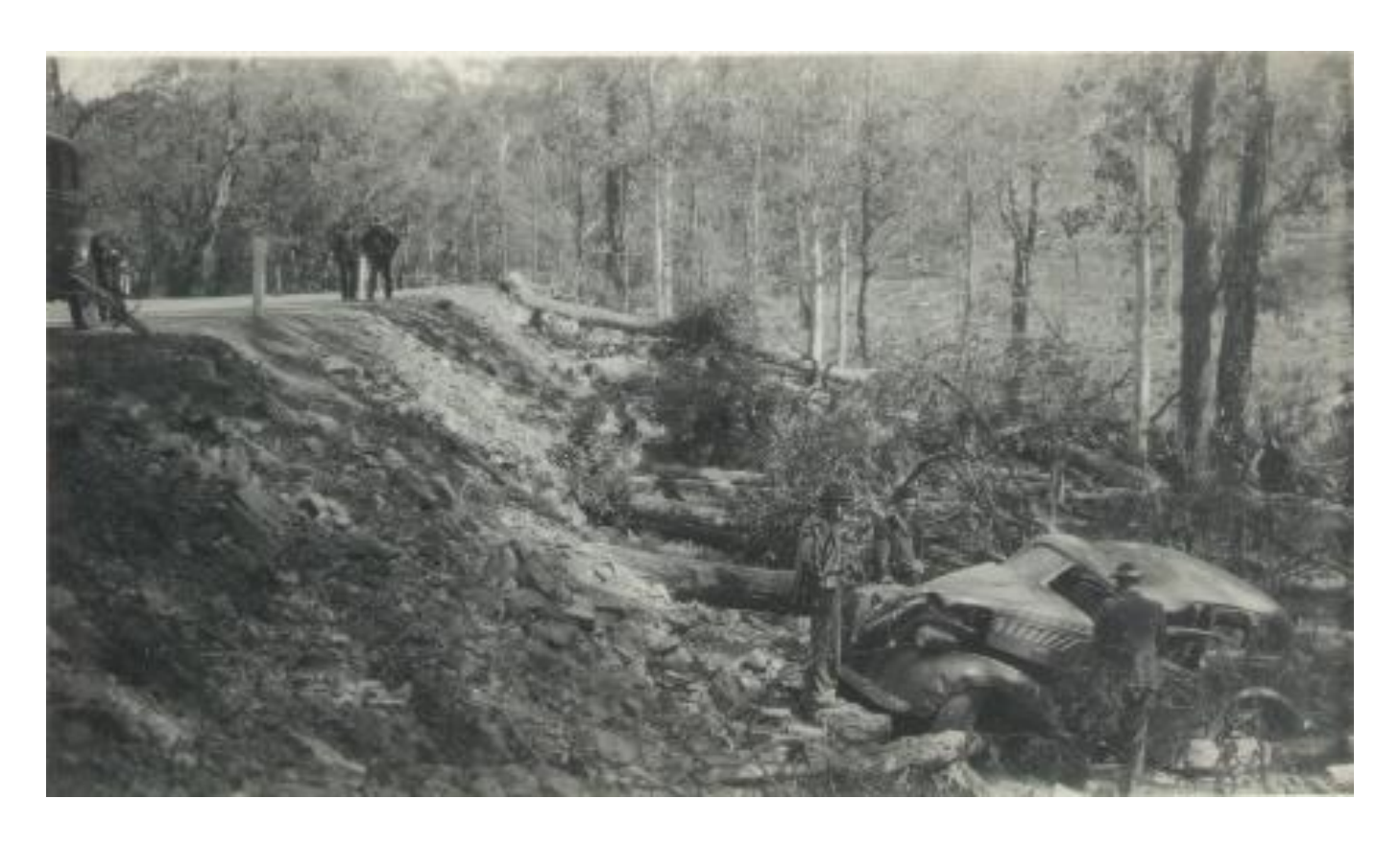
Recovering a car on the road to Orbost.