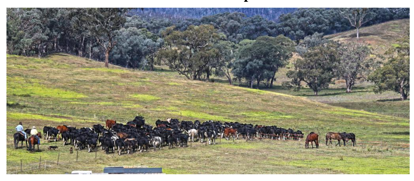
Above: Turning the cattle out.