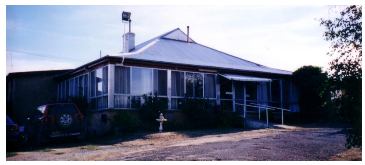
The Old Delegate Hospital when it was still a hospital.